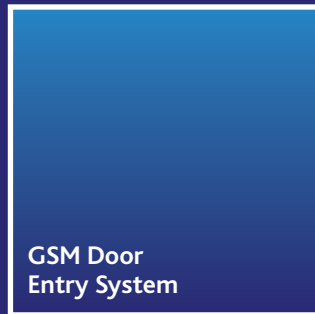
GSM Door Entry System